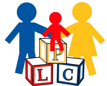
Preschool Learning Center