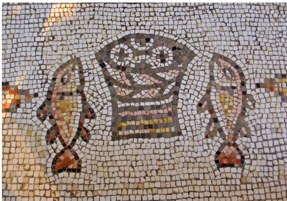
Floor mosaic at the Church of the Multiplication, Tabgha, Israel

A theophany is a divine appearance, when a god or deity becomes visible or displays their power to human beings. Scripture is full of divine appearances. They bring up for us the question What does God look like? Or, to put it another way, When will we know that we have seen God? Or, to put it another way, What does God do?