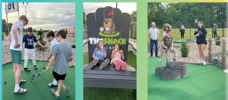
Enjoying Our Christian Life