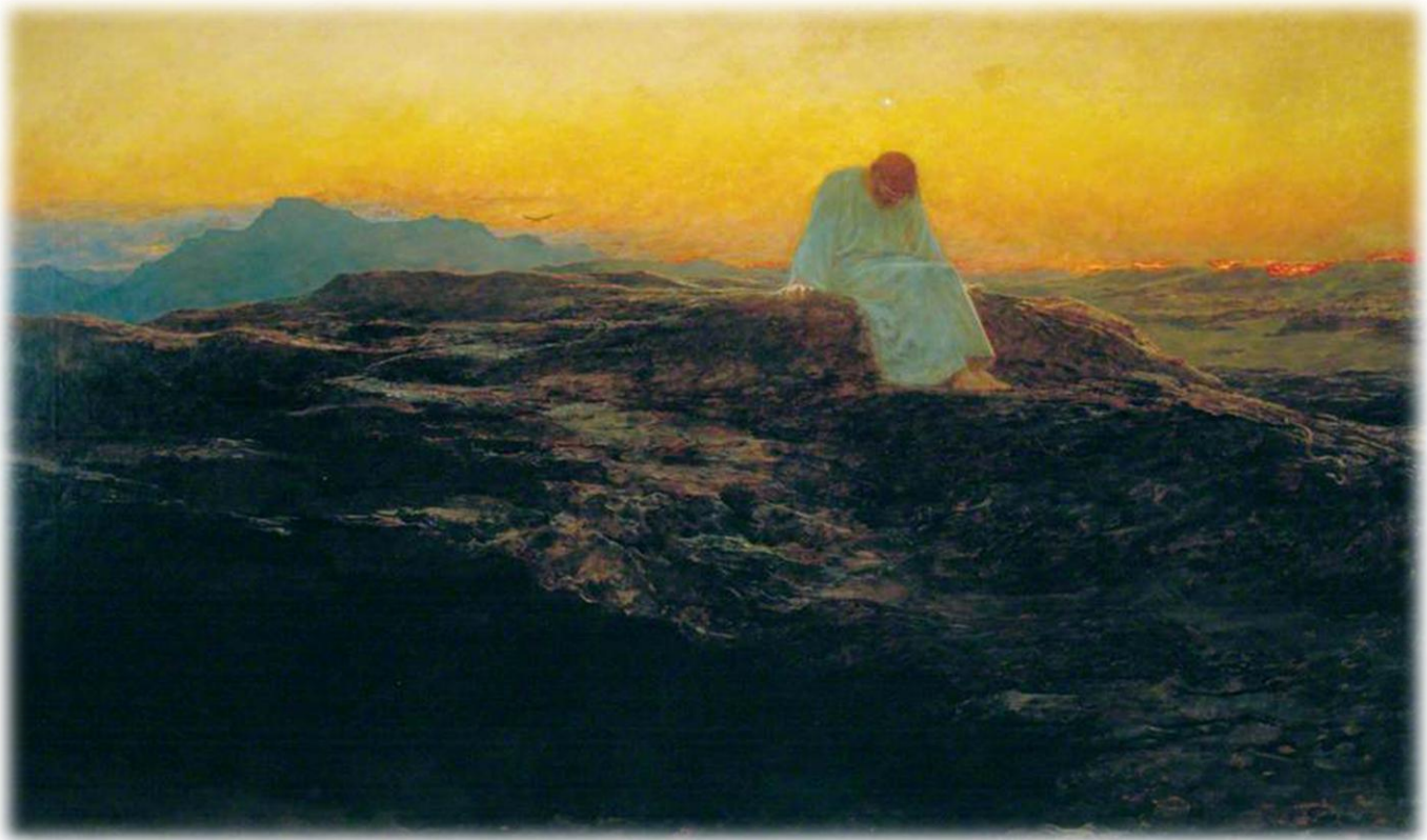
Temptation in the Wilderness , 1898. Artist: Rivière, Britton, 1840-1920*