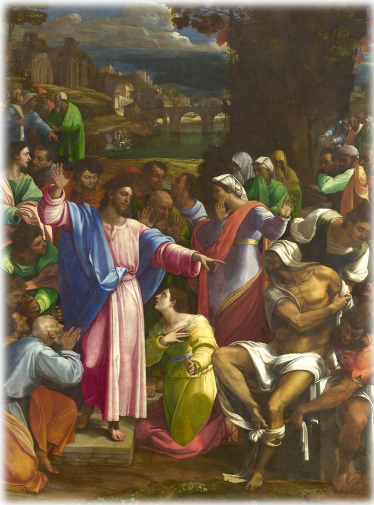
Raising of Lazarus, 1517-1519. Artist: Piombo, Sebastiano Luciani, 1485-1547.