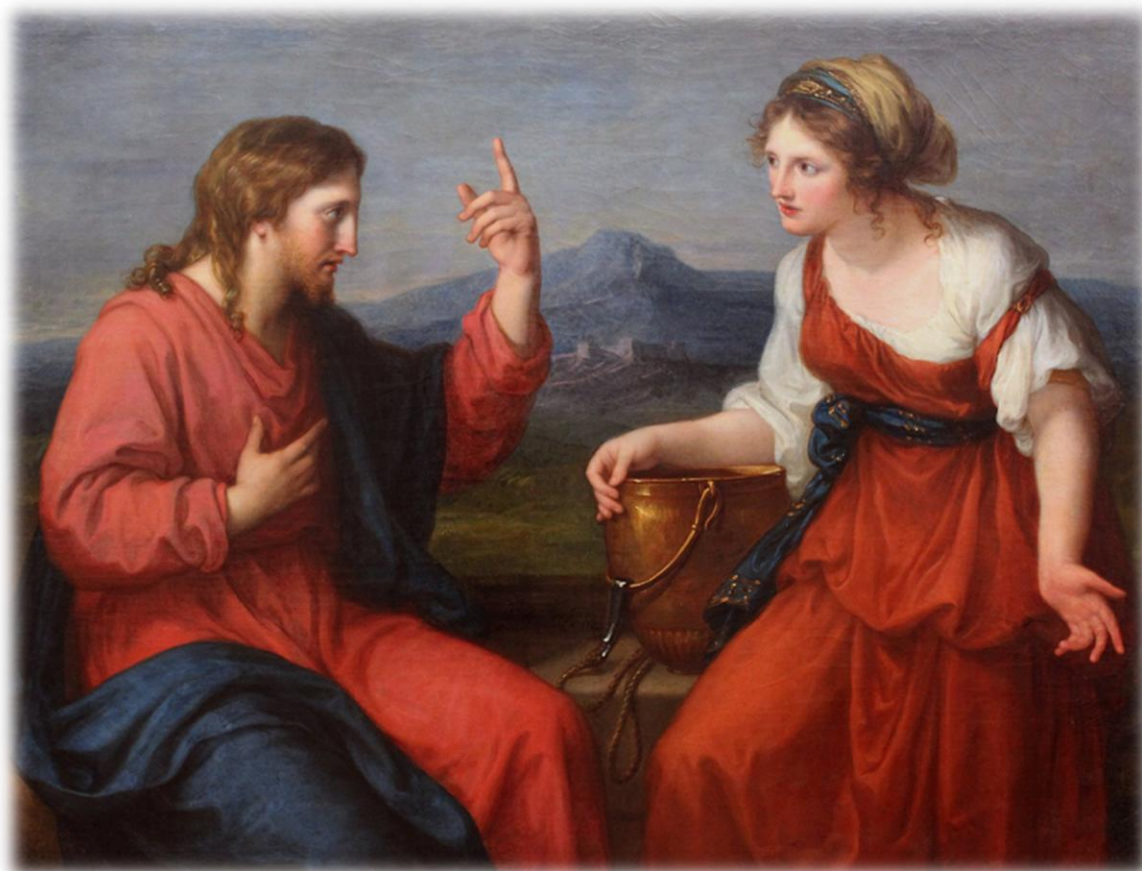
Christ and the Samaritan Woman, 1796. Artist: Kauffmann, Angelica, 1741-1807*